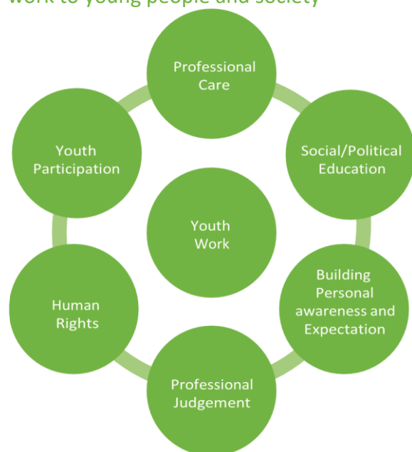
Figure 2: Dividends of professional youth work to young people and society

they work with, to develop the ability to take and manage responsibility, as well as deal with the consequences of action.